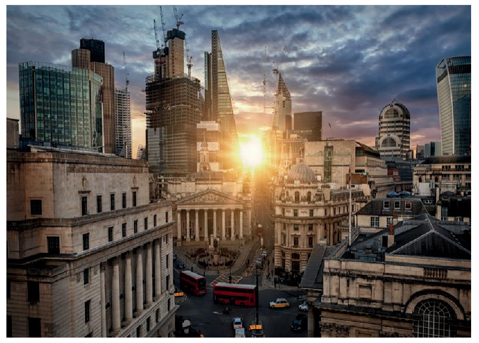
Written March 2020 and updated September 2021

Financial advice and regular reviews are essential to help position your portfolio in line with your objectives and attitude to risk, and to develop a well-defined investment plan, tailored to your objectives and risk profile.